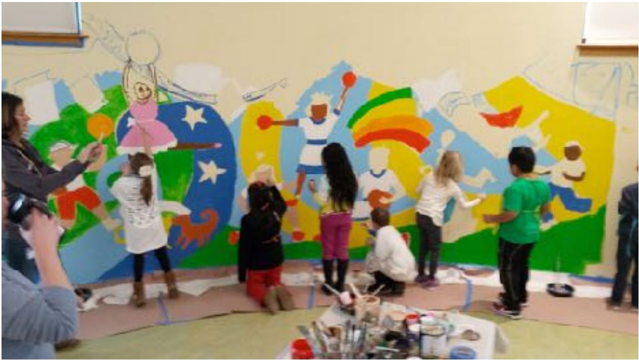
Riley Avenue ES, Calverton, 2015