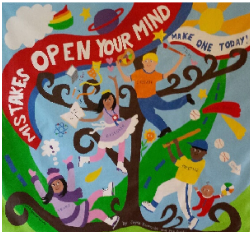
Southbay ES, West Babylon, 2015