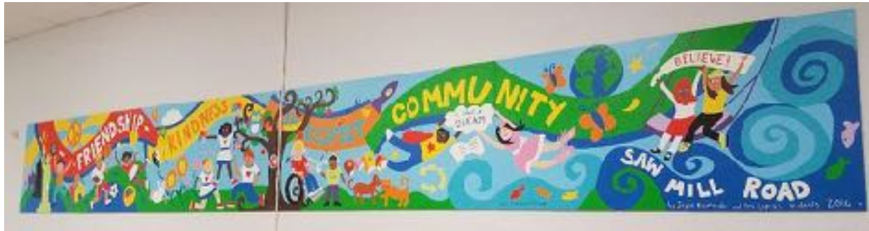
Sawmill ES, North Bellmore, 2016