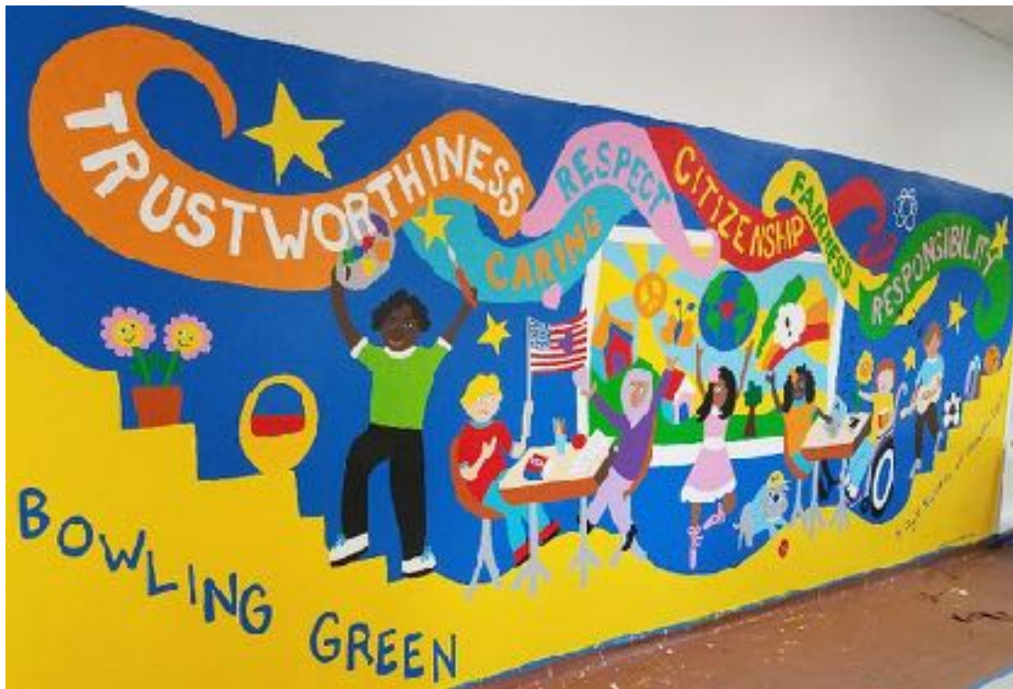
Bowling Green ES, Westbury, 2016