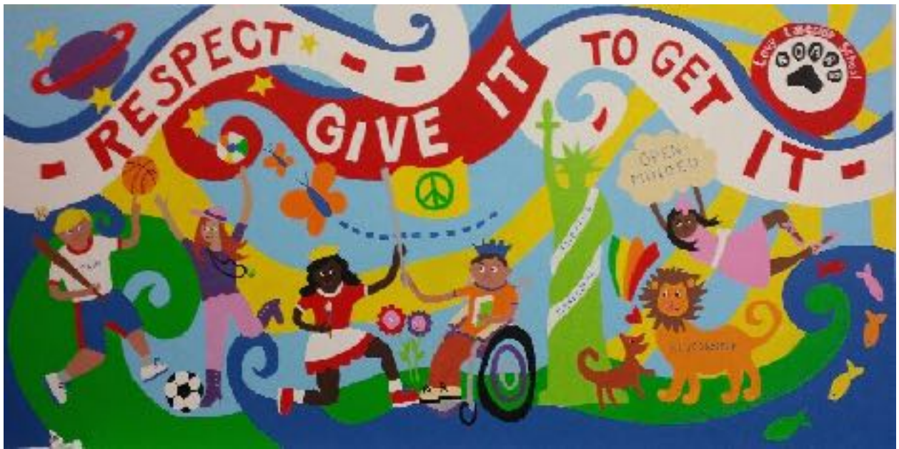
Levy-Lakeside ES, Merrick, 2015