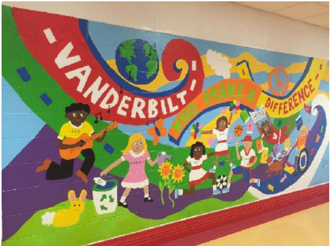
Vanderbilt ES, Deer Park, 2014