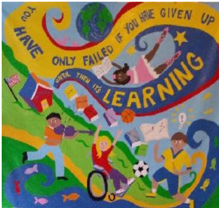
Southbay ES, West Babylon, 2015