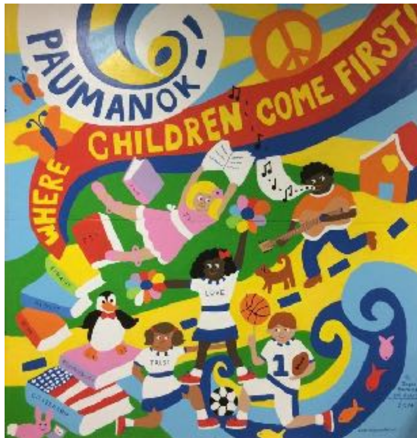
Paumanok ES, Deer Park, 2014