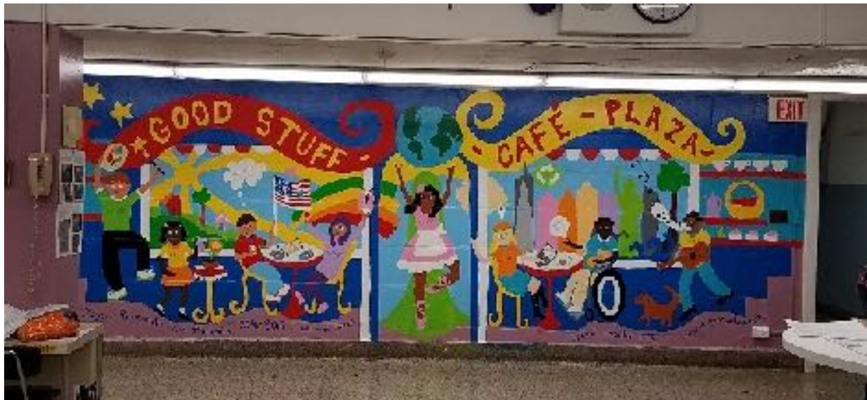
Plaza ES, Baldwin, 2016