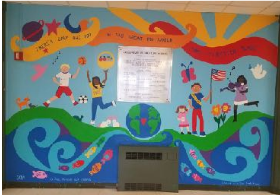
Santapogue ES, West Babylon, 2019