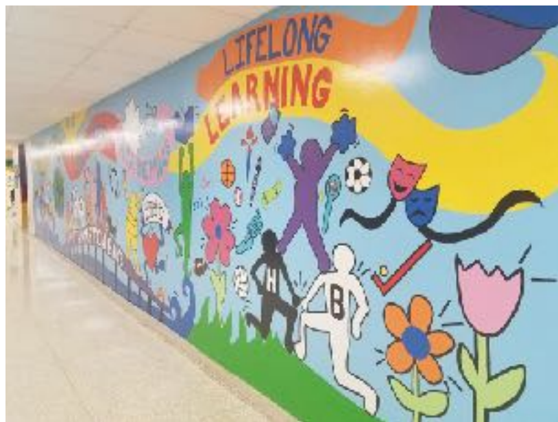
Hampton Bays HS, 2018