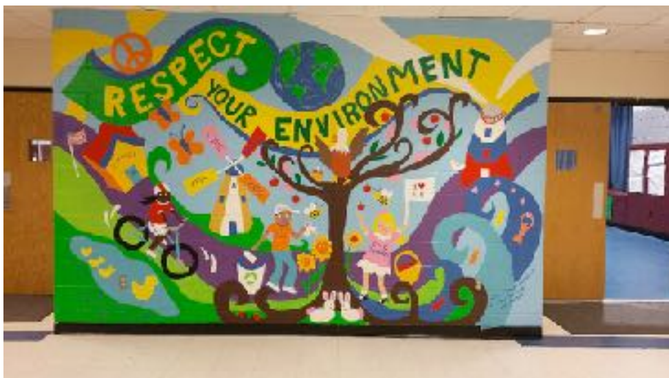
John J. Marshall ES, East Hampton, 2016