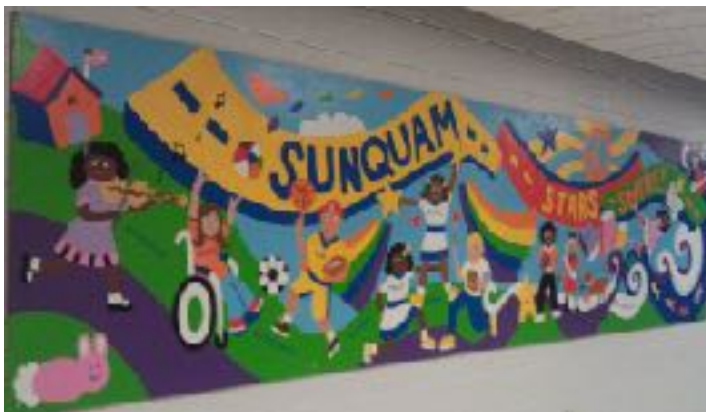
Sunquam ES, Deer Park, 2014