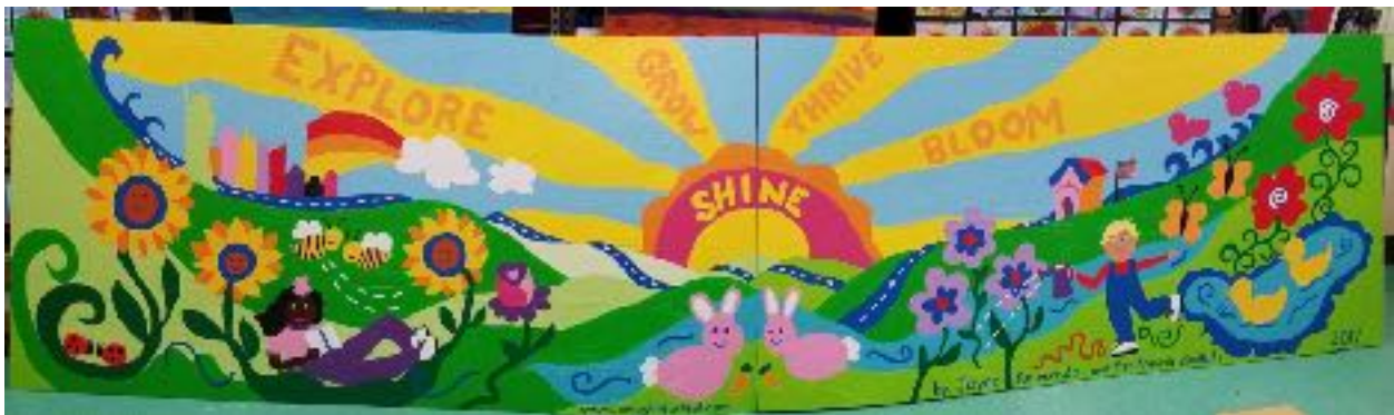
Aqueboque ES, 2017