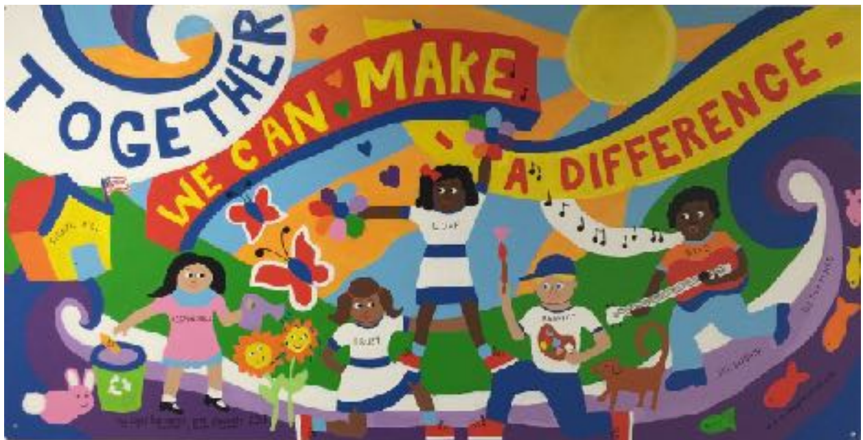
Signal Hill ES, Deer Park, 2014