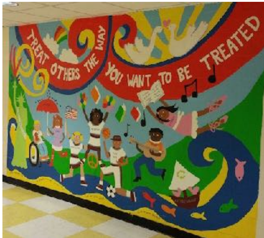
John J. Marshall ES, East Hampton, 2015