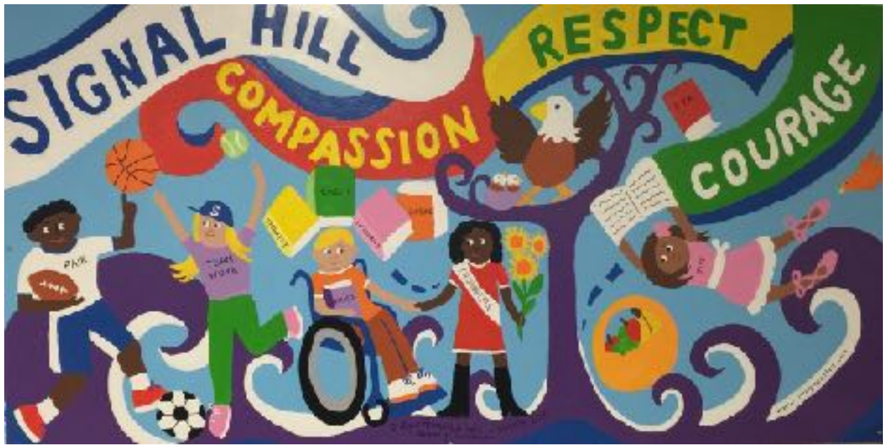
Signal Hill ES, Deer Park, 2014