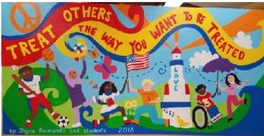
Oyster Ponds ES, 2018