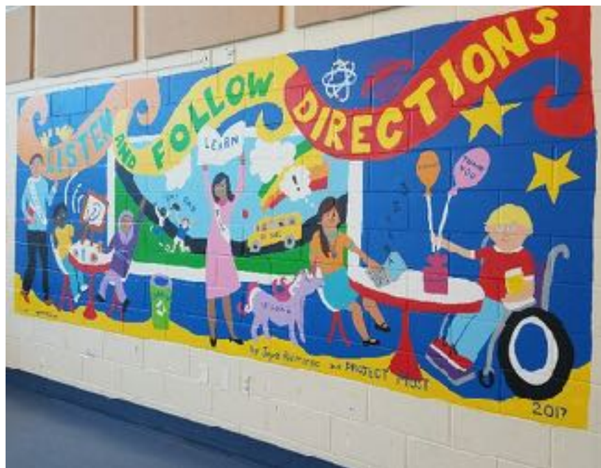
John J. Marshall ES, East Hampton, 2017