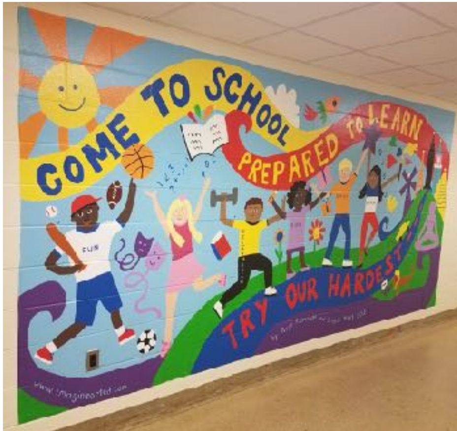
John J. Marshall ES, East Hampton, 2018